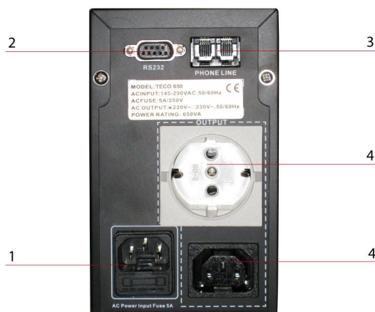
Office LCD 650 VA