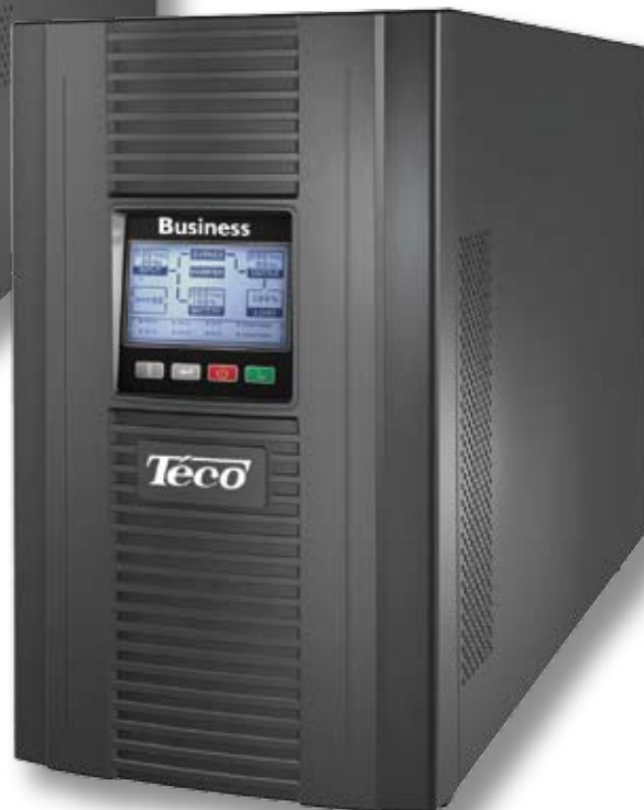
Business 2000/3000 VA