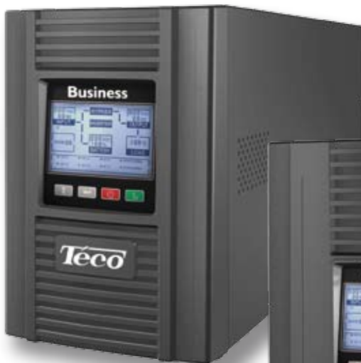
Business 1000 VA